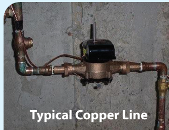
Typical Copper Line

The City of Joliet is completing an inventory of water service line materials. An interactive water service line material map is available on the City’s website at www.Joliet.gov/GetTheLeadOut . Please use this map to find out, when available, the material of the water service at your house. The City is also offering a cost share program to residents with confirmed lead water service lines. The City will replace the public portion of the water service (b-box to water main) at no cost if the homeowner replaces the private portion (b-box to meter). Approximate costs to the homeowner are $2500-$5000. Payment plans with the City for this work will be available with negotiable terms. To discuss participating in this program, please contact the Department of Public Utilities at 815-724-4220. In addition to the cost-sharing program, the City of Joliet is also utilizing the IEPA Low Interest Loan Program with principal forgiveness to complete projects in parts of the City where there are concentrated locations of known lead service lines. Please visit the City’s website to learn more about this program and the areas where lead water service line replacement is targeted. This program, which replaces lead water service lines at no cost to the homeowner, will continue as long as funding is available.