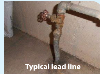
Typical lead line