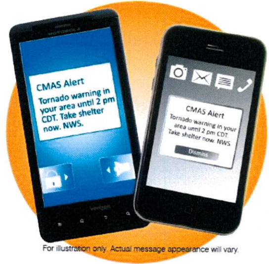
For illustration only. Actual message appearance will vary.

The alerts will tell you the type of warning, the affected area, and the duration. You'll need to turn to other sources, such as television or your NOAA All-Hazards radio, to get more detailed information about what is happening and what actions you should take.