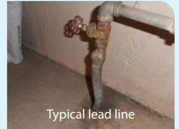
Typical lead line