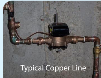
Typical Copper Line

The City of Joliet is completing an inventory of water service line materials. An interactive water service line material map is available on the City’s website at www.Joliet.gov/GetTheLeadOut . Please use this map to find out, when available, the material of the water service at your house. The City is also offering a cost share program to residents with confirmed lead water service lines. The City will replace the public portion of the water service (b-box to water main) at no cost if the homeowner replaces the private portion (b-box to meter). Approximate costs to the homeowner are $2500-$5000. Payment plans with the City for this work will be available with negotiable terms. To discuss participating in this program, please contact the Department of Public Utilities at 815-724-4220. In addition to the cost-sharing program, the City of Joliet is also utilizing the IEPA Low Interest Loan Program with principal forgiveness to complete projects in parts of the City where there are concentrated locations of known lead service lines. Please visit the City’s website to learn more about this program and the areas where lead water service line replacement is targeted over the next four years. This program, which replaces lead water service lines at no cost to the homeowner, will continue as long as funding is available.