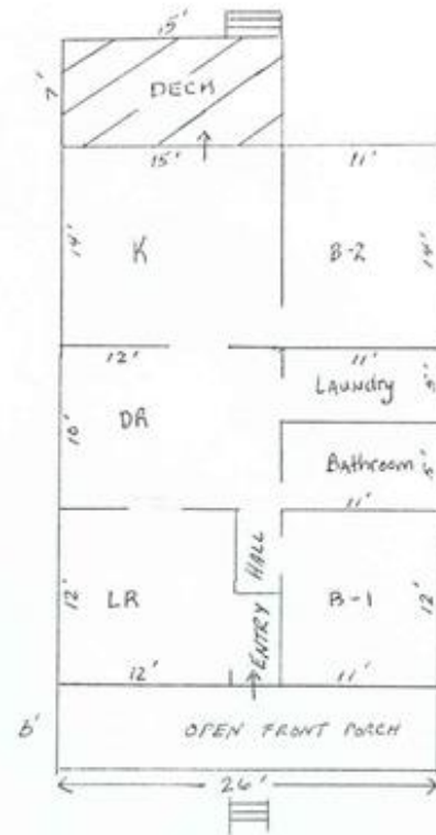
Sample Floor Plan (For illustrative purposes only)