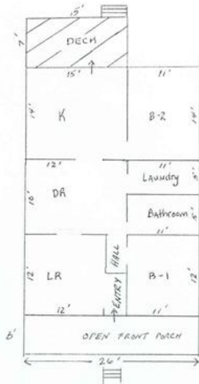
Sample Floor Plan (For illustrative purposes only)