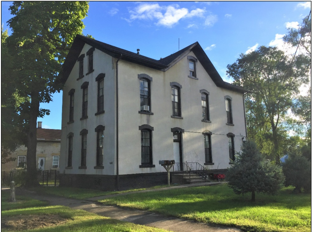
Figure 5: 600 North Broadway

600 NORTH BROADWAY STREET – the City Council designated the property as a Local Historic Landmark at its October 15, 2019 meeting. The JHPC held a public hearing on the proposed Local Historic Landmark designation at its September 25, 2019 Regular Meeting. The house was nominated for its architectural and historical significance. The house at 600 North Broadway Street is a two-story, Italianate style house. The cross-gable roof line, arch topped windows with heavy stone hoods, and tall, narrow, paneled entry door with a single-light transom reflect the Italianate style. The walls are limestone under stucco (which has been painted white for several decades). This house was built by German immigrants, and their cultural influence is visible in this home’s simple massing and minimal architectural detail. The City Council Memo packet, which includes the landmark nomination, is available on the City’s website for this Council meeting date.