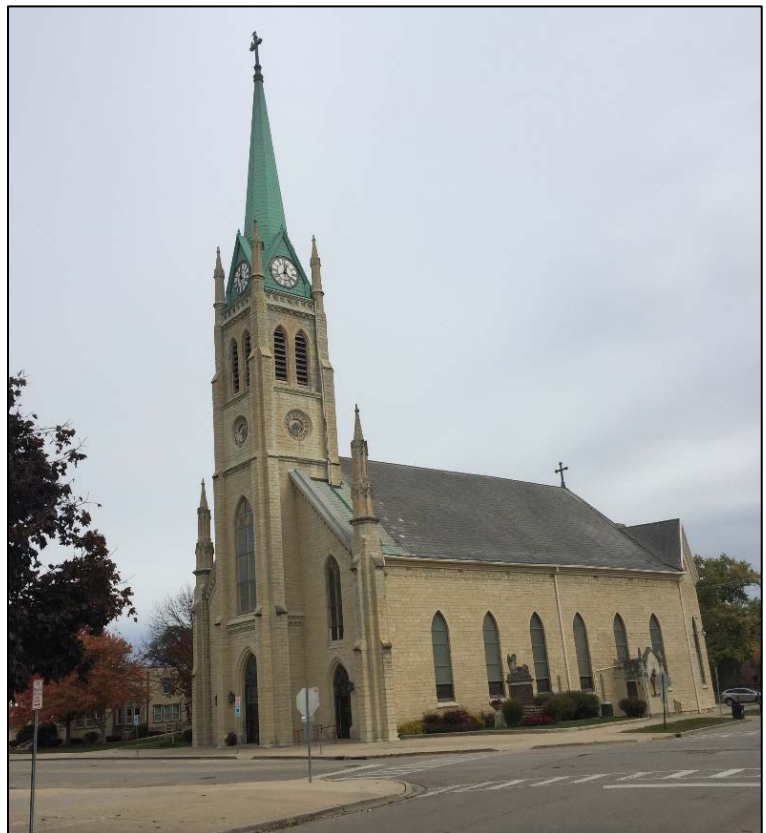
Figure 13: St. John's (German) Catholic Church

The City entered into a contract with McGuire Iglesias & Associates, Inc. in September 2019 to complete the survey project. The project will be completed by September 2020. The City Council Memo packet, which includes the RFP, is available on the City's website for the September 17, 2019 Council Meeting.