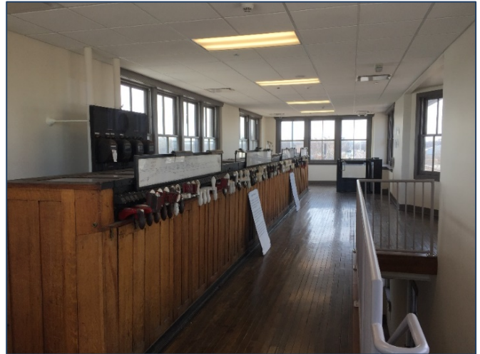
Figure 16: 3 rd Floor of U.D. Tower. View of the lockbed machine

UPDATE OF JHPC RULES (BYLAWS): The JHPC reviewed and approved an amendment to Section II.F (Setting of Agenda) of its Rules (bylaws). Staff proposed an amendment to Section II.F (Setting of Agenda) of its Rules (bylaws) in order to move-up the filing deadline for agenda items from seven (7) business days prior to the next regularly scheduled meeting to fifteen (15) business days prior to the next regularly scheduled meeting. Staff proposed this amendment in order to provide staff with adequate time to prepare a thorough staff report on submitted agenda items. The staff report on the approved amendment to the Rules can be found as an attachment.