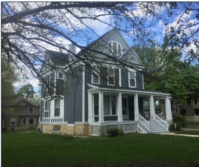
Figure 17: 513 Western Avenue