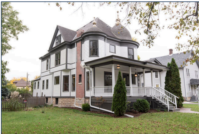
Figure 19: 708 Western Avenue