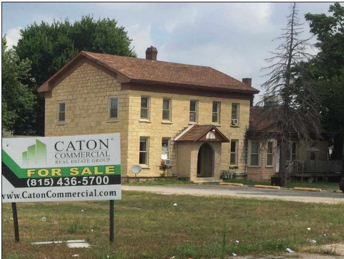
Figure 12: 411-413 East Jackson Street

411-413 EAST JACKSON STREET – Preliminary Review was held at the JHPC’s September 25, 2019 Regular Meeting. The nomination for Local Historic Landmark designation for this structure was withdrawn at the October 23, 2019 Regular Meeting. The applicant, a JHPC commissioner, withdrew the application because the City entered into a development agreement with the property owner at its October 15, 2019 City Council Meeting, which set forth terms and conditions for the relocation of the Casseday House to an agreeable location with funding provided by the developer. Pursuant to Section 8-612 of the Joliet Historic Preservation Ordinance, the Agreement was deemed the final decision by the City Council, removing the authority of the Commission from this matter. The City Council Memo packet, which includes the development agreement, is available on the City’s website for this Council meeting date. The draft landmark nomination form is available upon request.