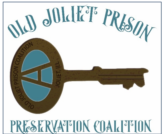
Figure 18: Old Joliet Prison Preservation Coalition Logo