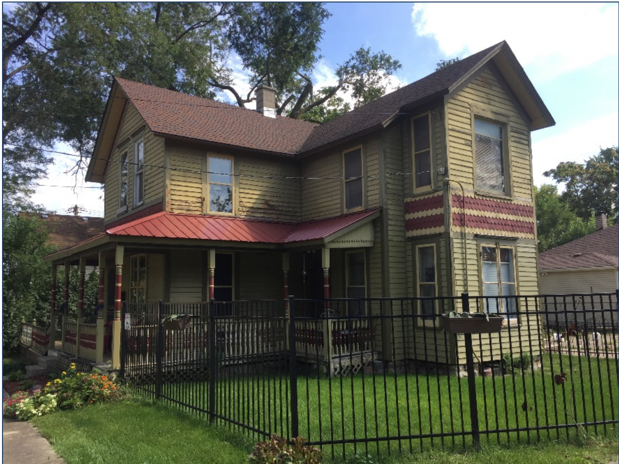
Figure 6: 512 McDonough Street

512 MCDONOUGH STREET – the City Council designated the property as a Local Historic Landmark at its October 15, 2019 meeting. The JHPC held a public hearing on the proposed Local Historic Landmark designation at its September 25, 2019 Regular Meeting. The house was nominated for its architectural significance. The house is a well-preserved, circa 1889, clapboard-sided, gable-front-and-wing house with elements of the Queen Anne style. The corner property is located in the earlier settlement area of the St. Pat’s Neighborhood, and this house was the first to be built on this block according to city directories and available maps. The City Council Memo packet, which includes the landmark nomination, is available on the City’s website for this Council meeting date.