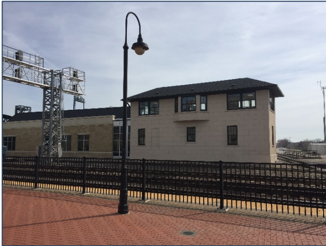
Figure 15: Exterior View of U.D. Tower, facing west

Museum and local volunteers, will undertake the following activities under its local match requirement: development of the exhibit narrative, programming of the space, establishing the operational framework of the space, and project administration. The project will be completed by September 30, 2020. The City Council Memo packet, which includes the scope of work, is available on the City's website for the July 2, 2019 Council meeting date.