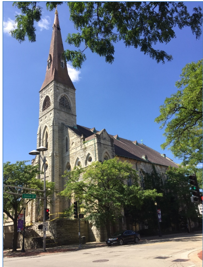
Figure 11: 113 N. Ottawa Street (St. Mary Carmelite Church)

St. Mary Carmelite Roman Catholic Church was completed in 1882 to serve the spiritual needs of the City's growing Catholic population on the east side. St. Mary's influenced the establishment of other Roman Catholic churches, cemeteries and schools on the east side of Joliet, functioning as the "mother church." The Church is a notable work of a master American architect, Patrick Charles Keely, who became one of the nation's most prolific Catholic architects. Of note, Landmarks Illinois arranged for a pro-bono conditions analysis of the structure by Wiss, Janey, Elstner Associates, Inc. which determined the Church to generally be in stable condition and in serviceable condition. The City Council Memo packet, which includes the landmark nomination, is available on the City's website for this Council meeting date.