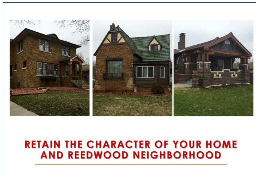
Figure 21: Presentation delivered to the Reedwood Neighborhood Association

PRESENTATIONS ON “RETAINING HISTORIC CHARACTER IN YOUR NEIGHBORHOOD” AND “PROMOTING THE CITY’S HERITAGE”: Commissioners and staff delivered presentations on the importance of retaining the character of one’s home and on the City’s historic resources as part of a campaign to promote the City’s neighborhoods and the City’s heritage. Presentations included: Bicentennial Bluff’s Neighborhood Association (January 2019), City Council (February 2019), Three-Rivers Realtors Association (March 2019), Reedwood Neighborhood Association (April 2019), and Cathedral Area Preservation Association (May 2019).