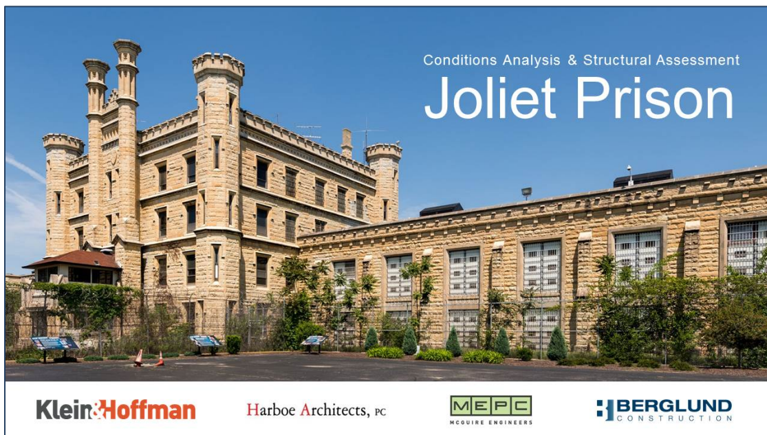
Figure 14: Slide from the City Council Presentation on the Award of Conditions Analysis and Structural Assessment Contract

2018 CERTIFIED LOCAL GOVERNMENT GRANT: The City received a 2018 Certified Local Government Grant for a Conditions Analysis and Structural Assessment of Prison West. The City entered into a contract with Klein and Hoffman Associates to perform the work, which included the assessment of the following six (6) priority structures at the Prison: Administration Building, East Cell Block, West Cell Block, Chapel, Hospital, and Brick Stack of Power House. The total contract amount was for $74,000, of which $51,840 of total project costs will be reimbursed to the City. The project started in January 2019. The draft report was made available to the City in March 2019. City staff worked with the firm on a final draft. The report was presented to the Prison Committee on May 13, 2019. The City Council reviewed and accepted the report at its May 21, 2019 meeting. The City Council Memo packet, which includes the final report, is available on the City's website for this meeting date. The State Historic Preservation Office has within its possession the final report.