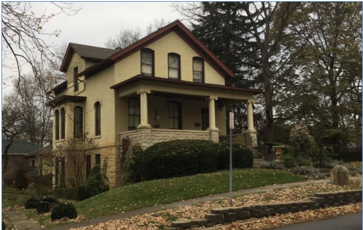
Figure 2: Local Historic Landmark at 601 North Center Street

601 NORTH CENTER – the City Council designated the property as a Local Historic Landmark at its February 19, 2019 meeting. The JHPC held a public hearing on the proposed Local Historic Landmark designation at its December 19, 2018 Regular Meeting. The house was nominated for its architectural significance. The 1 ½ story, front gable, brick Italianate style house includes tall arched windows with brick hoods and a bay window on the southern elevation, which appears two-stories in height because the bay extends downward to the basement level below. The pre-1862 house sits on a large, sloping corner lot at the northwest corner of Douglas and Center Streets. The house is built into this slope, causing the house to appear two-and-a-half stories in height from its southern elevation. The high limestone foundation is a unique and defining feature of this house. The City Council Memo packet, which includes the landmark nomination, is available on the City's website for this Council meeting date.