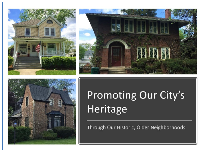
Figure 1: Presentation delivered to the Cathedral Area Preservation Association

Goal: Establish and launch one or more regularly offered tours in partnership with the JAHM. City staff and the JHPC, in partnership with the Joliet Area Historical Museum, were not able to establish and launch more regularly offered tours.