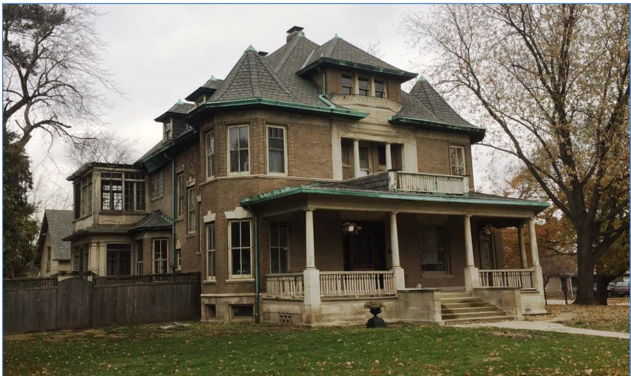
Figure 3: Local Historic Landmark at 903 Western Avenue