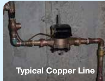
Typical Copper Line

The City of Joliet is offering a cost share program to residents with confirmed lead water service lines. The City will replace the public portion of the water service (b-box to water main) at no cost if the homeowner replaces the private portion (b-box to meter). The City already has a contractor on-call to complete the work and will coordinate the work for the homeowner. In most cases, the work will be completed using directional drilling to the maximum extent possible to minimize disruption to your yard. If you have a basement, the basement wall will be core drilled to allow the new water service line to enter at approximately the same location as the existing water service line. If your home is built on a slab, a small section of the slab will be saw cut and removed for installation of the new water service line. Approximate costs to the homeowner are $2500-$5000. Payment plans with the City for this work will be available with negotiable terms. To discuss participating in this program, please contact the Department of Public Utilities at 815-724-4220.