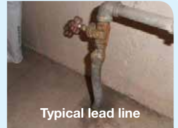
Typical lead line