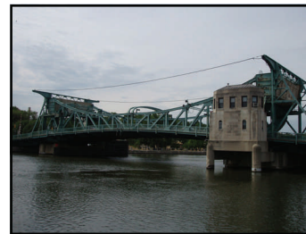
Jefferson, Cass, Jackson, & Ruby Streets

Completed in 1969, the Will County Courthouse, embodies the distinctive characteristics of modernist design. Concrete braces that extend upwards from the ground floor actually support the top 3 floors of this weighty building. The smooth concrete facade lacks architectural embellishments emphasizing geometric shape over any traditional style. Finally, the differing window patterns were meant to visually symbolize the specialized interior functions of each floor.