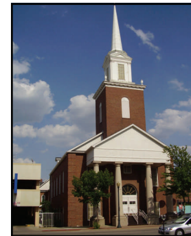
100 N. Scott St.

Built in 1927, the structure is an eight-story, red-brick, Bedford stone and terra cotta, Renaissance Revival style hotel designed by architect Noyes Roach. The structure exhibits the characteristic use of varied Classical pediments, simple ornamentation and rhythmic fenestration. The structure was the finest hotel in Joliet and was known throughout the region for its elegance and luxury. The building has been recently renovated into apartments with first floor commercial space.