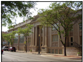
204 N. Ottawa St.

The Neoclassical Revival style structure was designed by Julian Barnes based on the Renaissance Triumphal Arch motif. The structure was built in 1909 as the third location of the United Methodist Church in Joliet. The congregation merged with another congregation in 2003. The congregation sold the structure to the City of Joliet in 1993. The city renovated it into a historical museum from 1996-2003. It is now known as the Joliet Area Historical Museum.