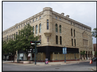
150 N. Chicago St.