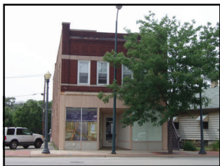
501 N. Chicago St.