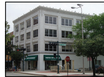
81 N. Chicago St.

Heralded as one of the "most beautiful theatres in the nation," the Rialto Square Theatre opened in 1926 as a vaudeville movie palace to replace the Crystal Stairs theatre, which had burned in 1918. Designed by noted architects Rapp & Rapp, the theatre features a floating balcony and gold-infused, multi-story arch over the front entry.