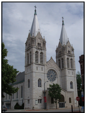
416 N. Chicago St.

St. Mary's (Carmelite) Church is a Gothic Revival style, circa 1882, Joliet limestone structure that is set on a raised foundation, which houses the parish hall. The Church has a traditional 3-part Gothic façade, with a central tower/spire rising to a height of over 200 feet. The structure has limestone buttressing on the building corners and between all windows. The interior has a high, central nave with Gothic vaulting and side aisles carried on posts of clustered collinettes. A large stained glass skylight, portraying a white dove, is located in the apse of the church.