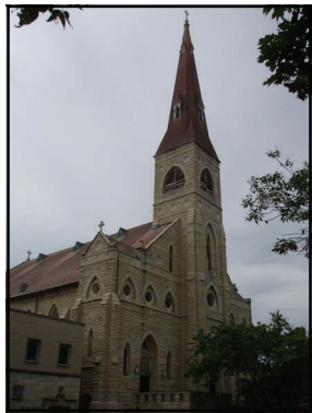
Ottawa & Clinton