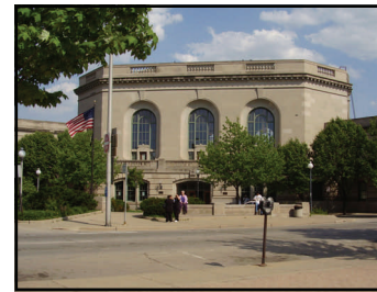
50 E. Jefferson St.