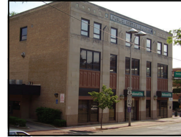
170 N. Ottawa St.

The Morris / Woodruff Building is a seven-story, Bedford stone, Gothic style, mixed-use commercial/office building built circa 1919. The noted Chicago architect William LeBaron Jenny designed the structure. It exhibits vertical and horizontal organization of facades by piers and spandrels. Gothic influences include arched, decorative windows with intricate detailing, and decorative cornices and moldings.