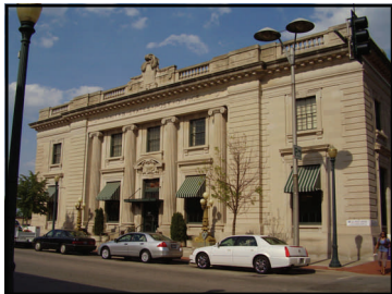
51 E. Clinton St.

Federal post office architect James Knox Taylor designed the two-story, sandstone, Neoclassical Revival style structure in 1903. The building exhibits classical influences with its massive, fluted, Ionic columns and by its cornice, dentils, and detailing on the symmetrical facades. An elaborate cartouche is located above the entrance. Stone balustrades located along the parapet reflect Baroque influences.