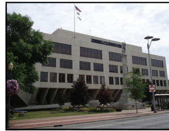
14 W. Jefferson St.

Built in 1912 by the Adam Groth Company, Union Station was designed by highly regarded architect Jarvis Hunt. The Bedford stone structure exhibits an imposing façade with grand arches, keystones, stone balustrades and cornice. Interior features include marble stairs and floors. The station was built as part of a major public works project. At the time of completion, Joliet was a major railroad hub, with 200 trains per day passing by Union Station.