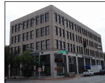
22 W. Cass St.

Noted architect H.V. Van Holst designed the 1930 Art Deco style structure with Bedford limestone exterior resting on a granite base. The Art Deco style is exemplified in the building massing and the cut glass, metalwork reliefs and decorative "turtle glass" light fixtures. The simple, smooth facades provide a background for highly detailed incised and relief ornament.