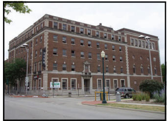
215 N. Ottawa St.

Designed by D. H. Burnham Co., the 1927 building is a 5-story Neoclassical Revival style structure. The main entrance is surrounded by ornamental limestone trim, including pairs of engaged columns and a stone arch capped with a stone pediment. An arch topped plate glass transom is located above the entry door, which is shielded by an original ornamental wrought iron grille. The Women's Addition was constructed in 1949.