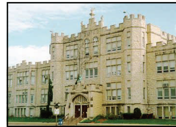
201 E. Jefferson St.