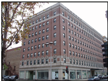
22 E. Clinton St.

Built in 1927, the structure is an eight-story, red-brick, Bedford stone and terra cotta, Renaissance Revival style hotel designed by architect Noyes Roach. The structure exhibits the characteristic use of varied Classical pediments, simple ornamentation and rhythmic fenestration. The structure was the finest hotel in Joliet and was known throughout the region for its elegance and luxury. The building has been recently renovated into apartments with first floor commercial space.