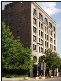
Chicago &amp; Jefferson Sts.