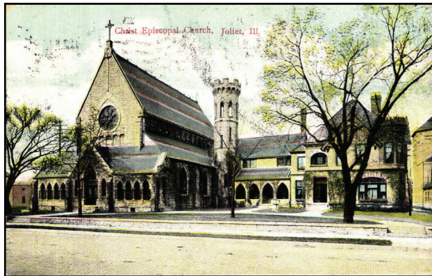
Christ Episcopal Church (1887-2006)