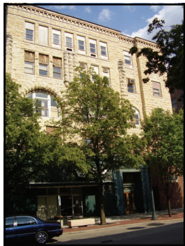
66 N. Chicago St.

Built in 1919, the Neoclassical Revival style structure was designed by architects Mundie & Jensen. The structure incorporates a massive colonnade with fluted columns, Corinthian capitals and dentillated moldings. The architect utilized Indiana Bedford limestone to accommodate the generous detailing as seen in the roof balustrade, decorative friezes and dentillated moldings.