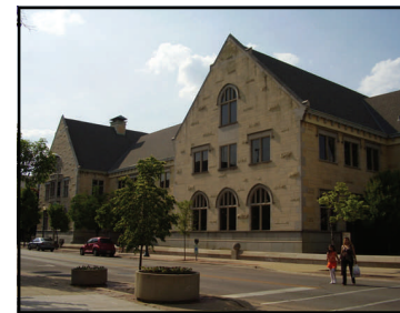
150 N. Ottawa St.

A circa 1918, four-story, brick and Bedford limestone structure designed by D.H. Burnham and Co. The original blueprints indicate that the building was supposed to be more elaborate and less streamlined than what was built. The structure was first housed the L.F. Beach Department store, followed by Goldblatt's, and finally Kline's. The building remained a department store until the mid-1980s. Presently, it houses a nightclub and upper-level offices.