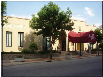
214 N. Ottawa St.