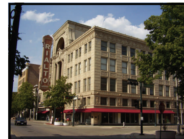
102 N. Chicago St.

Originally the First Baptist Church, St. Anthony's is Joliet's oldest church structure, built in 1858. The church was altered in 1902 when purchased by St. Anthony's parishioners. Around 1918, a steeple with a pinnacle cross was added to the three-story tower; and in 1980, the stucco façade was covered with a red brick façade. This church has historically been associated with the Joliet's Italian population.