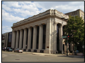
78 N. Chicago St.