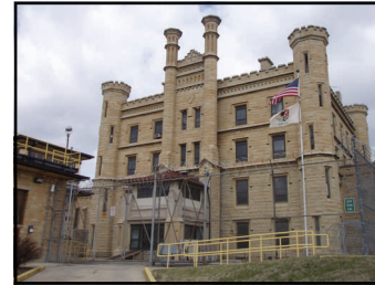
1125 N. Collins St.

Construction started on this notorious national landmark in 1857. Built with Joliet limestone, quarried simultaneously with its construction, this complex housed inmates until 2001 when it officially closed. One large building features a cell house in panoptical configuration. The federal penitentiary has garnered national attention through notorious inmates as well as movies like Blues Brothers. It was most recently the setting for the TV drama Prison Break.