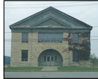
927 N. Collins St.

This structure marks the industry that earned Joliet its nickname: “City of Steel.” The Joliet Steel Company built this two-story limestone building in 1891. The large, rusticated, Syrian entry arch is characteristic of the Richardsonian Romanesque style while the symmetrical façade and pedimented roof with classical detailing bears strong influences of the Neoclassical Revival style. The Joliet Steel Company eventually came under the umbrella of the U.S. Steel Corporation. The building has largely sat vacant since the 1980s.