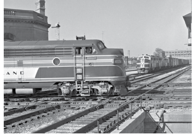
A Santa Fe freight train waits for a Rock Island train to cross the diamonds in downtown Joliet on October 14, 1951.

The Joliet Railroad Museum is located at 90 E. Jefferson St. within the City's Gateway Center Train Station. The Railroad Museum is ADA accessible. Metered parking is available in public lots surrounding the train station as well as on the street. The Joliet Railroad Museum is owned by the City of Joliet and operated by the Joliet Area Historical Museum. For the current hours of operation, call the Joliet Area Historic Museum at (815) 723-5201 or visit their website: www.jolietmuseum.org/ .