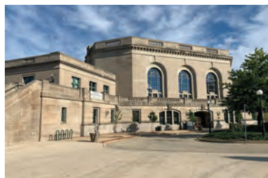
Union Station, Beaux-Arts style, 1912

The City of Joliet has added several new reports and information regarding Joliet's history and heritage, as well as historic preservation technical assistance to its website. You can find this information within the Planning Division's webpage on the City of Joliet's website. www.joliet.gov/historicpreservation .